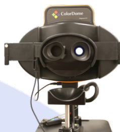
ColorDome with iMask