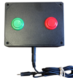
FST 2-button box